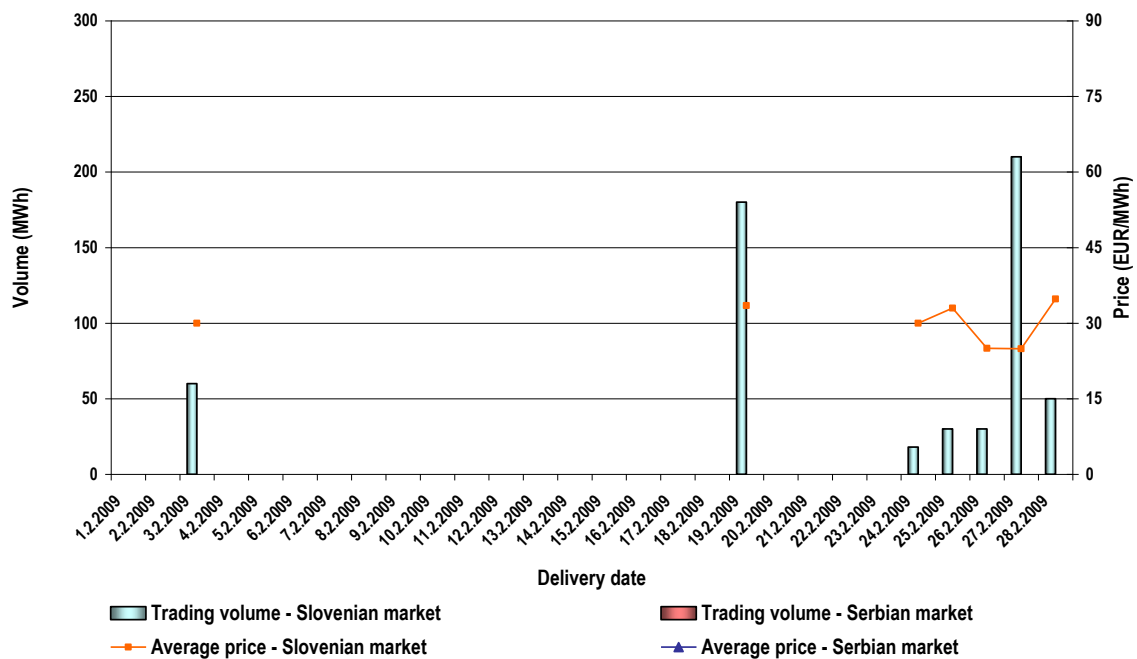
Total trading volume and average price in the Slovenian and Serbian market in February 2009

In the Slovenian and Serbian market 274 orders were entered in February. In the Slovenian market 266 orders were entered, most of them (63) with Base product. In the Serbian market 8 orders were entered in the same period, most of them (6) with Base product.